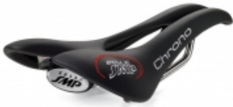
Chrono Black $299.99

Chrono, the seat born for time trials, has dimensions in compliance with UCI regulations. CHRONO is also ideal for junior racers. It is covered in real leather in the black versions and Lorica microfiber in the colored versions. This model does not hav [Product Details...]