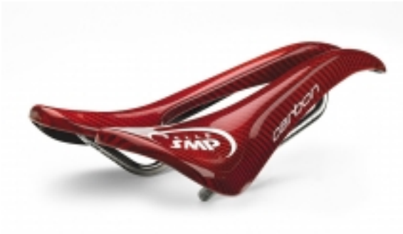
Carbon Red $399.99

â€œTopâ€ design, carbon structure and stainless steel frame. The Carbon and Carbon Color models are indicated for cyclists looking for comfort and the lightweight of carbon at an interesting price. A wide assortment of colors can be combined with the aesthet [Product Details...]