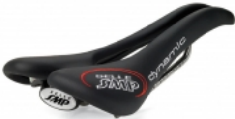
DYNAMIC Black $299.99