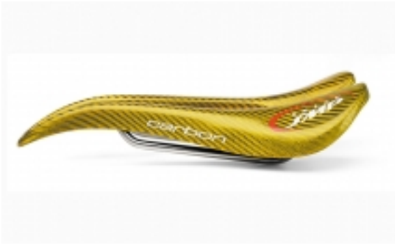
Carbon Gold $399.99

â€œTopâ€ design, carbon structure and stainless steel frame. The Carbon and Carbon Color models are indicated for cyclists looking for comfort and the lightweight of carbon at an interesting price. A wide assortment of colors can be combined with the aesthet [Product Details...]