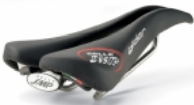
Glider Black $299.99

â€œTopâ€ design seat and a 100% carbon structure. The Full Carbon Lite model has been designed for cyclists who want a lightweight and more comfortable seat compared to the more narrow versions of the Carbon line. The patented features by Selle SMP, such as [Product Details...]