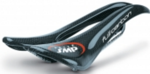
Full Carbon Black $549.99

â€œTopâ€ design seat and a 100% carbon structure. Winner of the Product Design Award 2006. The Full Carbon model is the top of the SMP4BIKE range and it is intended for cyclists looking for the lightest weight possible. The patented features by Selle SMP, s [Product Details...]