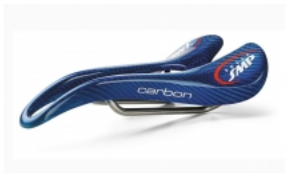
Carbon Blue $399.99

â€œTopâ€ design, carbon structure and stainless steel frame. The Carbon and Carbon Color models are indicated for cyclists looking for comfort and the lightweight of carbon at an interesting price. A wide assortment of colors can be combined with the aesthet [Product Details...]