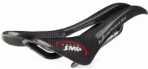
Full Carbon Lite Black $549.99

â€œTopâ€ design seat and a 100% carbon structure. Winner of the Product Design Award 2006. The Full Carbon model is the top of the SMP4BIKE range and it is intended for cyclists looking for the lightest weight possible. The patented features by Selle SMP, s [Product Details...]