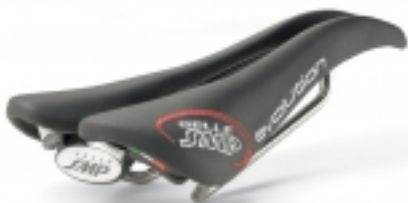
Evolution Black $299.99

The DYNAMIC model is the ideal seat for intensive training or free time cycling. It uses the structure of the Forma model joined with minimal padding. It is covered in real leather in the black versions and Lorica microfiber in the colored versions. It ha [Product Details...]