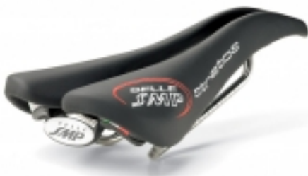
STRATOS Black $299.99

Lite 209 is the ideal seat for intensive training or free time cycling. It uses the structure of the Forma model joined with comfortable padding. It is covered in real leather in the black versions and Lorica microfiber in the colored versions. It has exc [Product Details...]