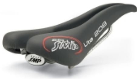
Lite 209 Black $299.99

Lite 209 is the ideal seat for intensive training or free time cycling. It uses the structure of the Forma model joined with comfortable padding. It is covered in real leather in the black versions and Lorica microfiber in the colored versions. It has exc [Product Details...]