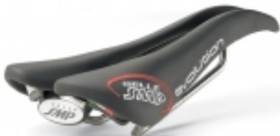
Evolution Black $299.99

The DYNAMIC model is the ideal seat for intensive training or free time cycling. It uses the structure of the Forma model joined with minimal padding. It is covered in real leather in the black versions and Lorica microfiber in the colored versions. It has [Product Details...]