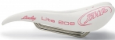
Lite 209 White Lady $299.99

Lite 209 is the ideal seat for intensive training or free time cycling. It uses the structure of the Forma model joined with comfortable padding. It is covered in real leather in the black versions and Lorica microfiber in the colored versions. It has exc [Product Details...]