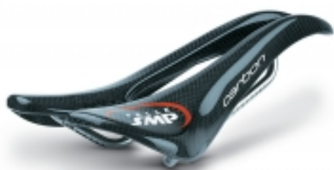
Carbon Black $549.99

â€œTopâ€ design, carbon structure and stainless steel frame. The Carbon and Carbon Color models are indicated for cyclists looking for comfort and the lightweight of carbon at an interesting price. A wide assortment of colors can be combined with the aesthet [Product Details...]