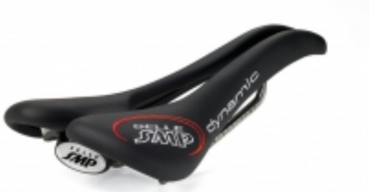
DYNAMIC Black $299.99

Chrono, the seat born for time trials, has dimensions in compliance with UCI regulations. CHRONO is also ideal for junior racers. It is covered in real leather in the black versions and Lorica microfiber in the colored versions. This model does not hav [Product Details...]